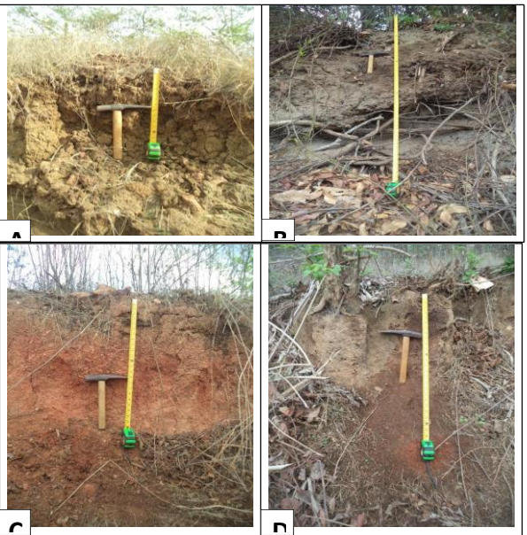
Figure 3: Soil profiles found in the Batoque river hydrographical sub-basin (A – Planosols; B – Fluvic Neosols; C – Litholic Neosols; D – Luvisols) (Mesquita 2019)

Figure 2: The Batoque river hydrographical sub-basin soils map (Mesquita; Oliveira 2019)