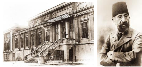
Resim1-2: Mekteb-i Sanayi-i Nefise, Osman Hamdi Bey