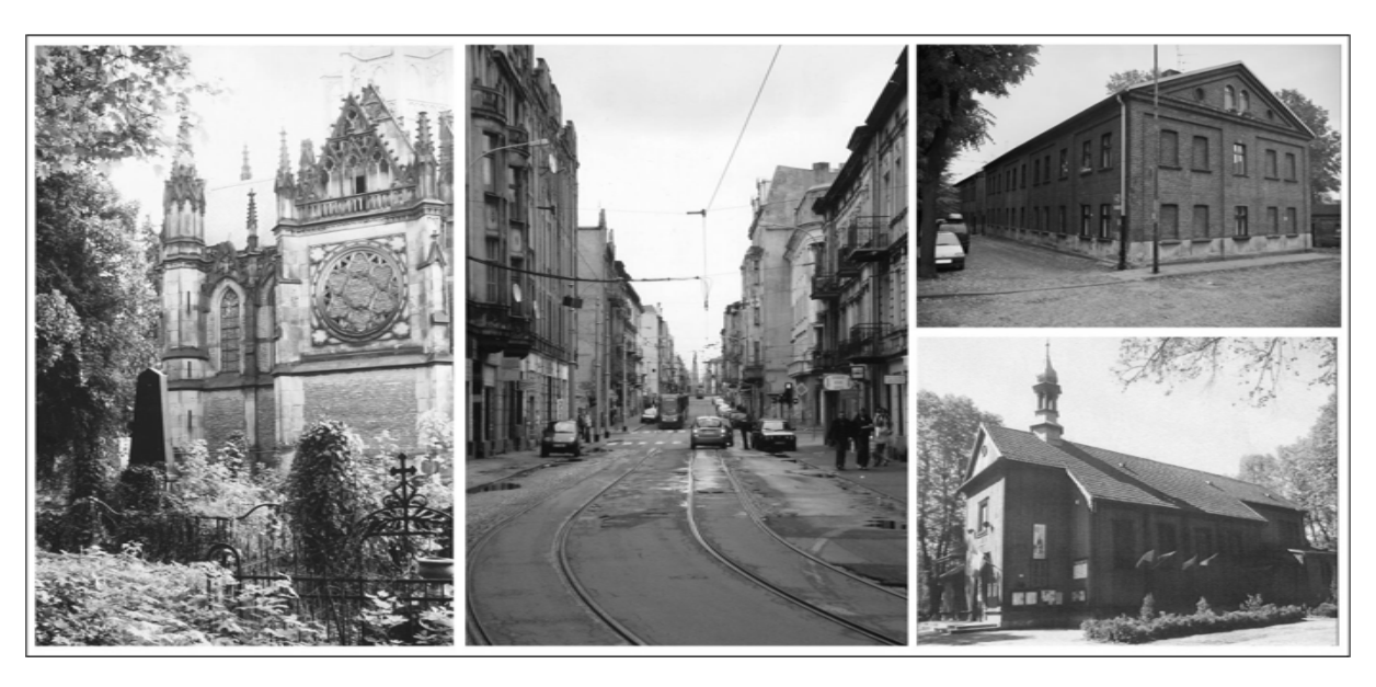
Fig. 4. Places in Lodz where time has stopped: CmentarzStary [Old Cementary], Legionów street, KsiężyMłyn, St. Joseph's Church