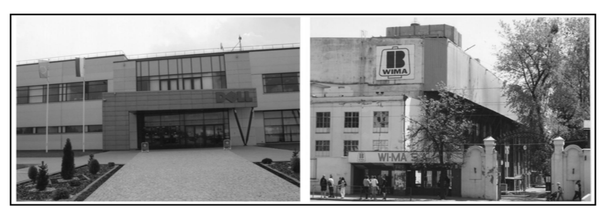
Fig. 2. Disproportions in Lodz urban space –places where one can see development and places where one can see: new and old industrial buildings– Dell and Wifama.