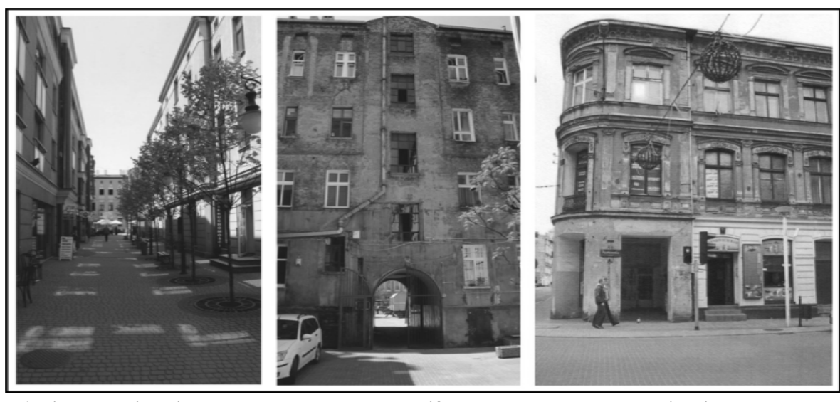
Fig. 1.Disproportions in Lodz urban space – beautiful and ugly places: yards in Piotrkowska street, tenement house on the corner of Piotrkowska and G. Narutowicza streets.