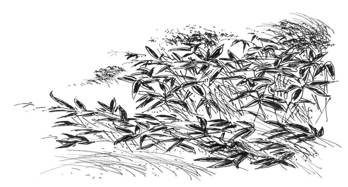
Fig. 6. Sagari Ha

Chinese Zen master, Daiju Ekai<sup>55</sup> (Suzuki, 1964, 2), wrote,