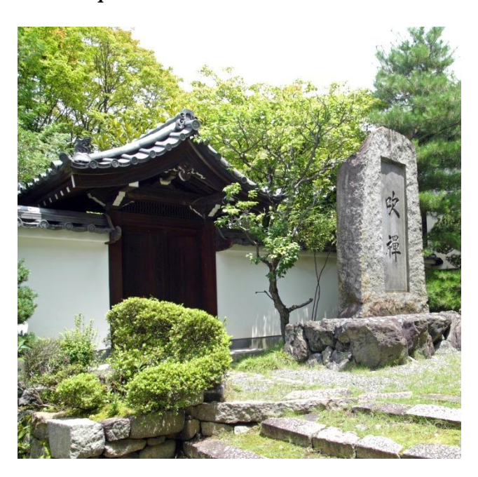
Fig.1: Myoan-jiTemple in Kyoto

The words "吹禅", suizen , were inscribed on a piece of stone at the entrance to a Japanese Zen temple called Myoan-ji (明暗寺) (Fig.1) in Kyoto. Suizen , literally meaning blowing Zen, is a practice by the Fuke Sect (普化宗) of Japanese Zen using the shakuhachi <sup>4</sup> bamboo flute (Fig. 2). Zen that penetrates into everyday spiritual life of Japanese culture (Suzuki, 1959) finds its representation in music<sup>5</sup> known as honkyoku which are special musical pieces composed for Zen shakuhachi practices.