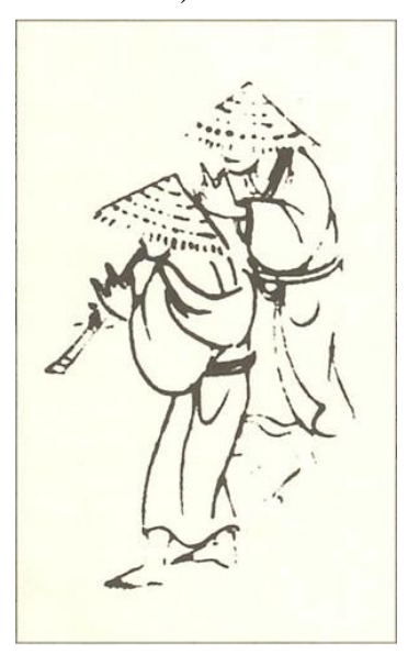
Fig. 3.Komoso in the Thirteenth Century

After the early spread of the instrument over a few centuries, the shakuhachi flourished as a popular Zen instrument in the 16<sup>th</sup> century, during the Edo period. Even the construction of the flute was adapted to include the root end of the bamboo. Blown on the other end, the shakuhachi was well suited for Zen meditation in the form of unaccompanied solo playing. Uninterrupted concentration of the mind and control of breath could be trained through rhythming with the unbroken long notes with the expressive instrument generating rich and mystic tones. This historical type of shakuhachi scalled the Komuso Shakuhachi which is the preceding form of the modern shakuhachi (Tanimura, 1990). Komuso <sup>8</sup> (monks of nothingness) are monks of the Fuke Sect. Supported by the Tokugawa government, the komuso (Fig. 3) were samurai with their shakuhachi as their weapons also. They wore a tengai basket hat and a kesa sash over the kimono. Together with the shakuhachi , these were the komuso 's three tools (Blasdel, 1988, 2). They also had three seals which were the honsoku (permit to enter the sect), the kai'in (personal identification) and the tsuin (travel document).