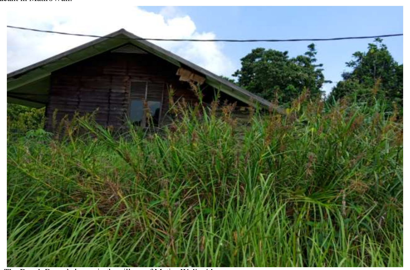
The Dayak Basap's house in the village of Matiro Wali without occupants

Another problem arises relating to this relocation program is that there are still pro and contra among Dayak Basap residents with this relocation program due to the land compensation payments in their place of origin in Keraitan village have not yet been paid off by PT. KPC. In addition, the Dayak Basap residents' scope of activities in Matiro Wali is also considered very limited, especially the space for hunting movement or mobility and others. As a result, there were several Basap residents who returned to their previous village in Keraitan so that several houses were left vacant in MatiroWali.