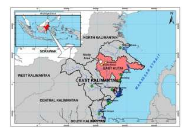
Research site is in Bengalon sub-district, East Kutai regency, East Kalimantan province.