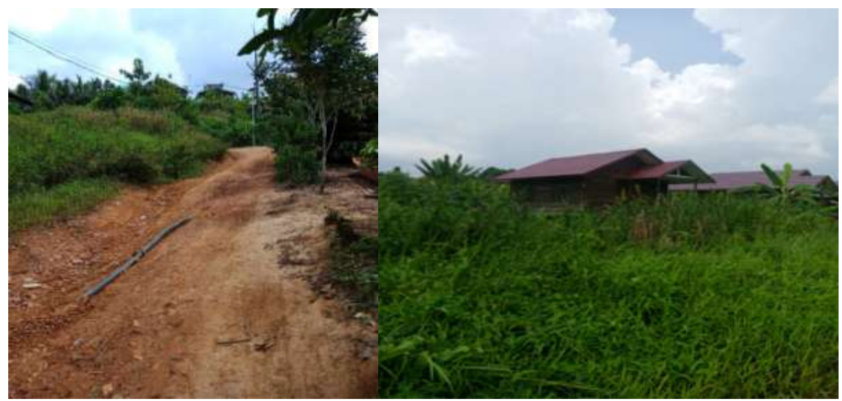
Access road built by PT.KPC