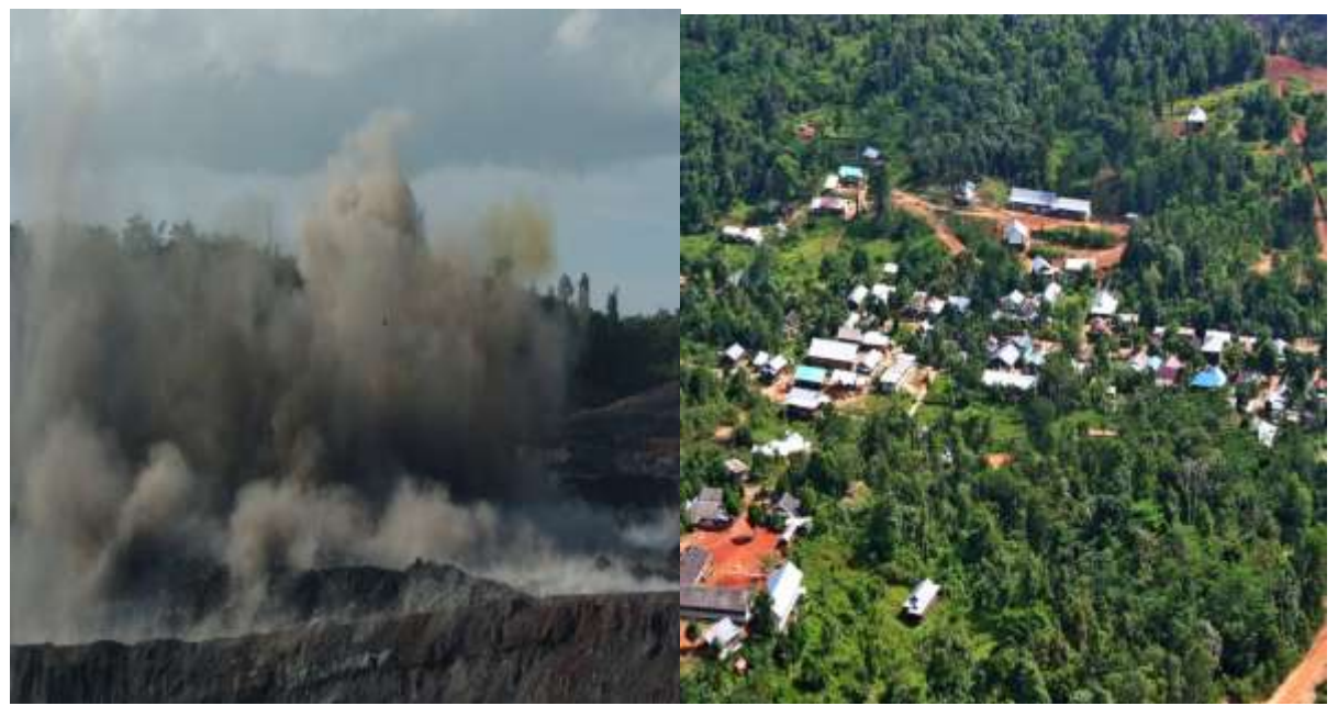
Mining activity (blasting) close to Dayak Basap Keraitan village (Basap old village) Settlement site.