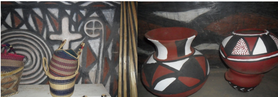
Plate 3: Baskets for Souvenir trade