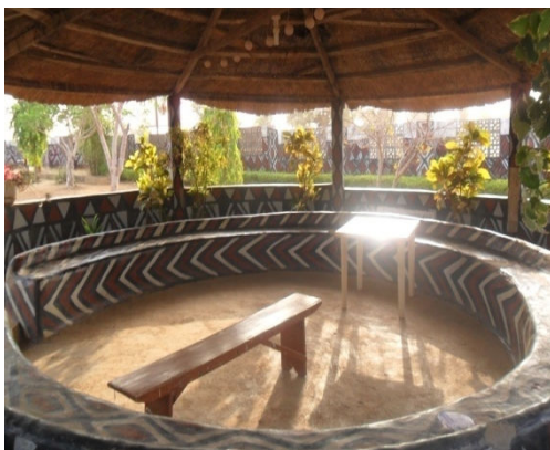
Plate 5: Summer hut for meetings