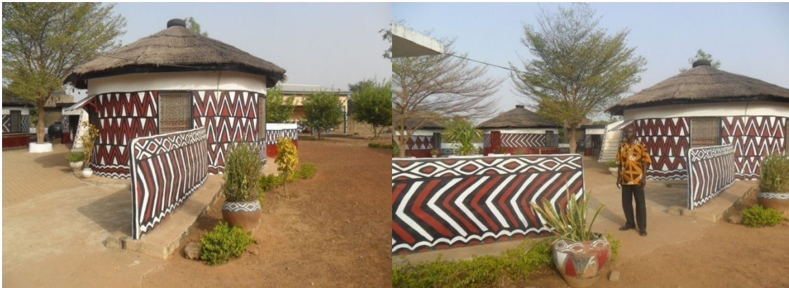
Plate 1: A local-styled guest house