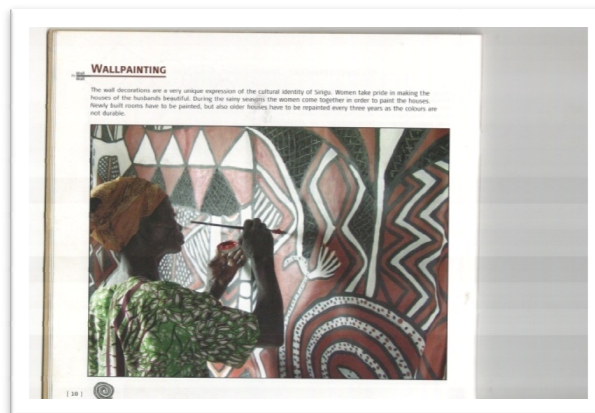
Plate 6: A female artist at work in Sirigu