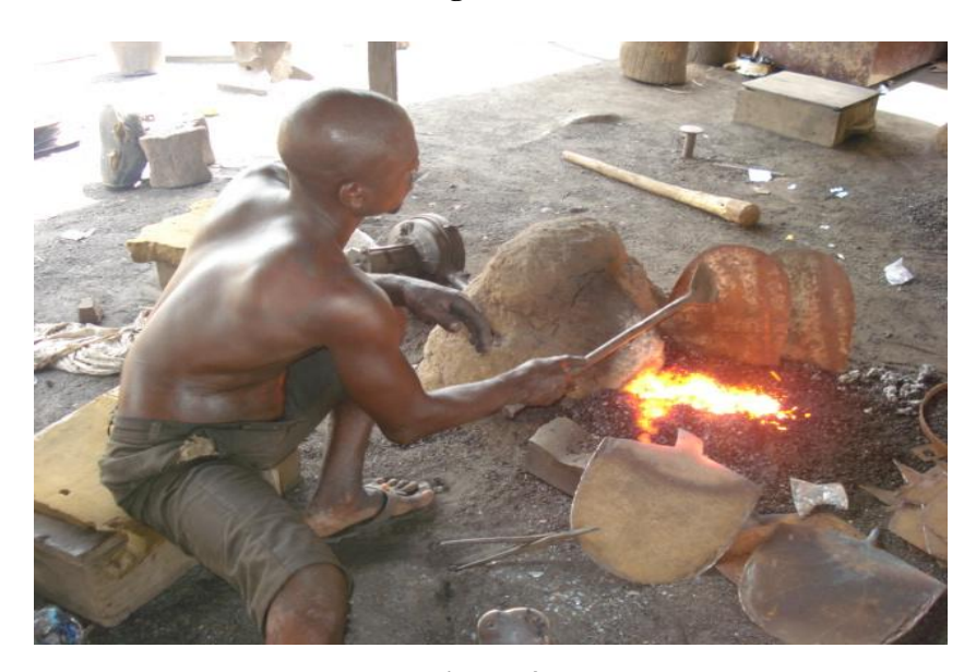
Figure 4b Some blacksmiths in their local factory (figures 4a & 4b)