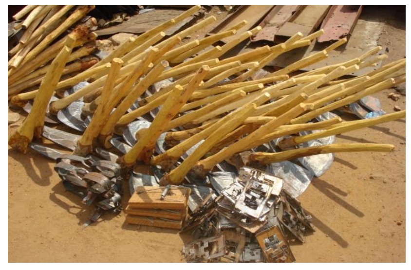
Figure 3: Locally fabricated farm implements by Blacksmiths in Oyo town, Nigeria