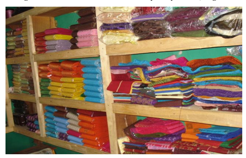
Figure 2: Locally woven fabrics displayed for sale in a shop at Iseyin, Oyo State, Nigeria