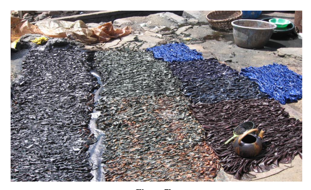
Figure 7b: Traditional tie and dye (Figure 7a&b)