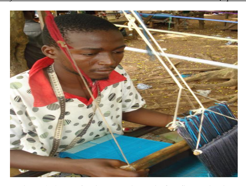
Figure 1: A local fabric weaver in Iseyin Oyo State, Nigeria