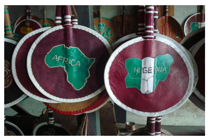
Figure 6b Leather works displayed in a shop in Oyo town, Nigeria. (Figures 5a&5b)