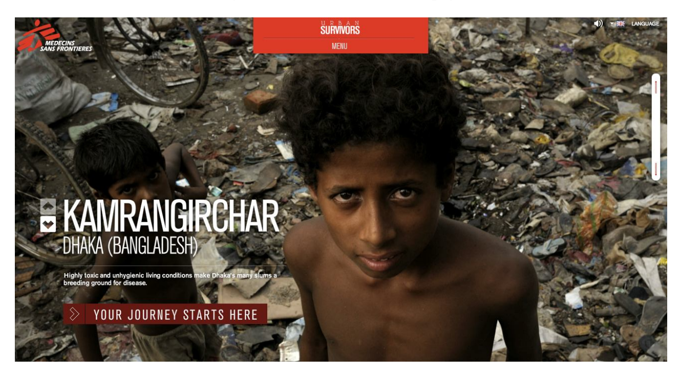
Figure 2: Urban Survivors, Kamparangirchar, Bangladesh