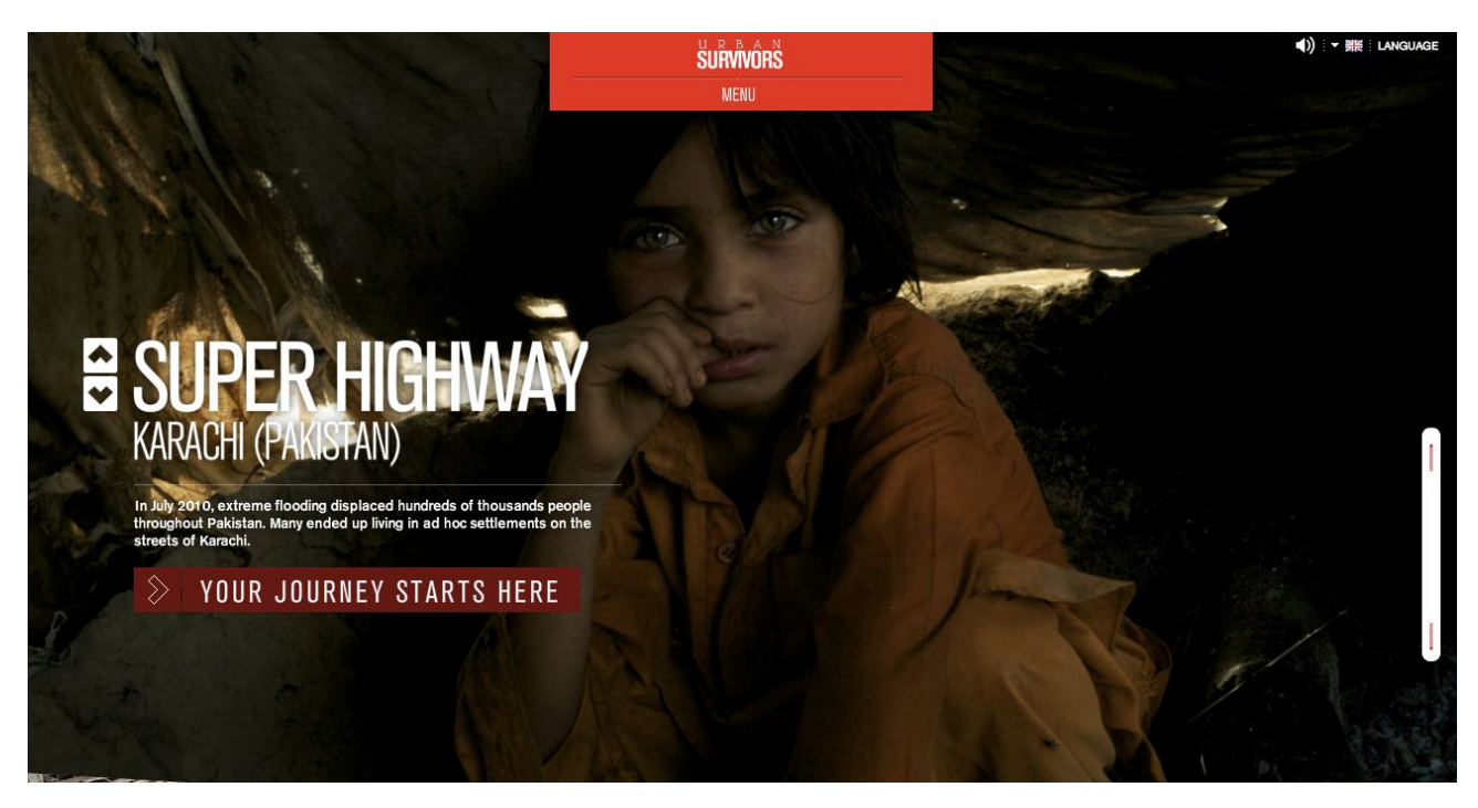
Figure 5: Urban Survivors, Super Highway, Karachi, Pakistan