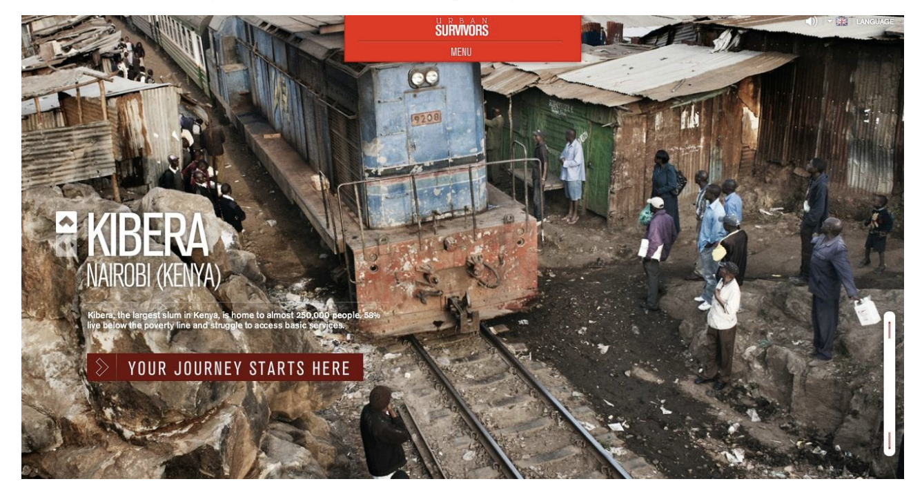
Figure 6: Urban Survivors, Kibera, Nairobi, Kenya