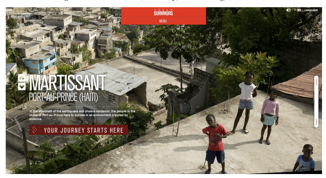
Figure 4: Urban Survivors, Martissant, Port-Au-Prince, Haiti