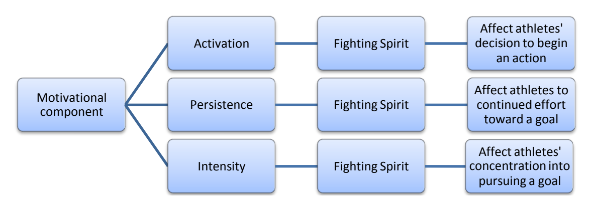
Figure 1: Motivational Components and Fighting Spirit among Athletes