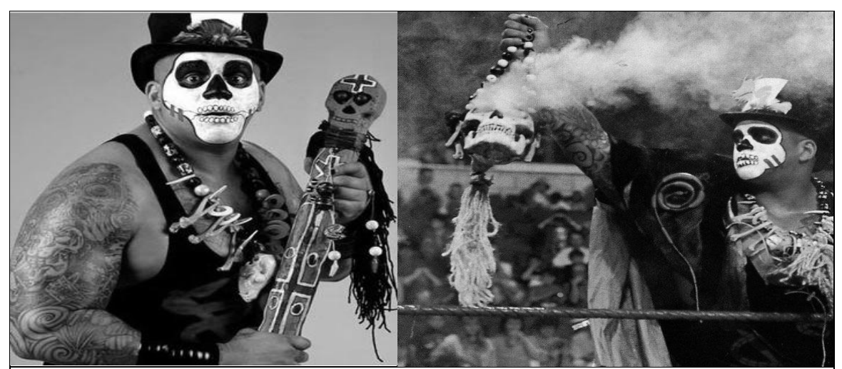
Figures 9 & 10: Chris Wright as Papa Shango of the World Wrestling Federation.

Sport-sociologist D. Stanley Eitzen (2009:42) reminds us that, "symbols of sport are both fair and foul... they bind together the individual members of a group, and they separate one group from another." Indeed, all sport franchises use symbols to craft a sense of community and create solidarity among its fan base. But there is also a potential dark side to their use. As Eitzen continues, sports symbols "may dismiss, differentiate, demean, and trivialize marginalized groups" in their attempts to create a highly visible and unique visual iconography (2009:42).