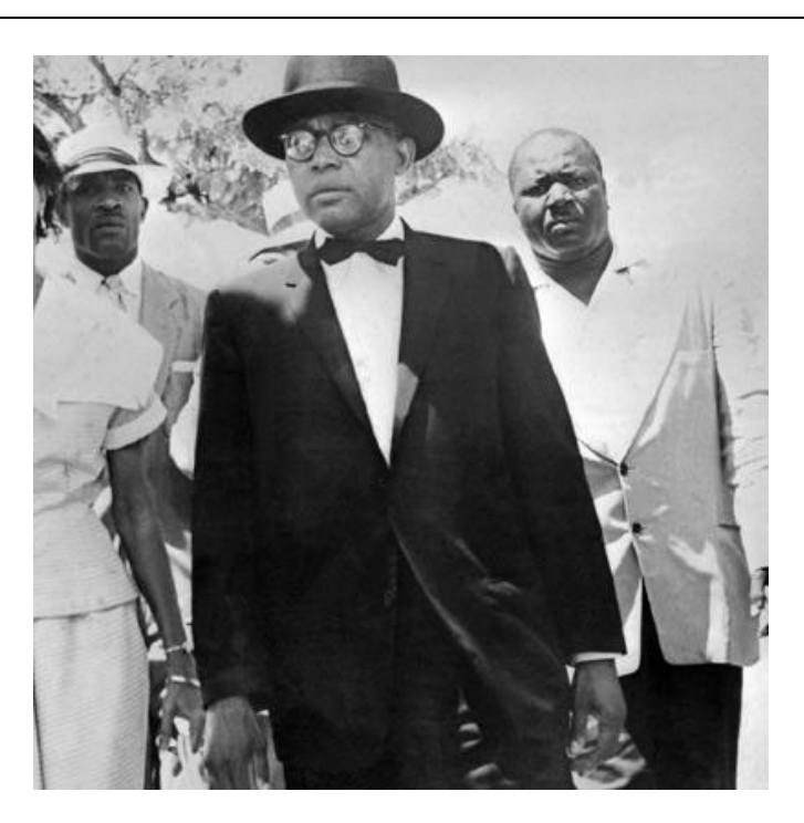
Figure 2: Haitian President Francois 'Papa Doc' Duvalier stands at attention during an unidentified ceremony, Haiti.

The Haitian dictator François Duvalier (also known as "Papa Doc"), who ruled from his election in 1957 to his death in 1971, often exploited the image of Baron Samedi to create fear, symbolic legitimacy, and political power. As Cirelli (2011, no page number) writes: