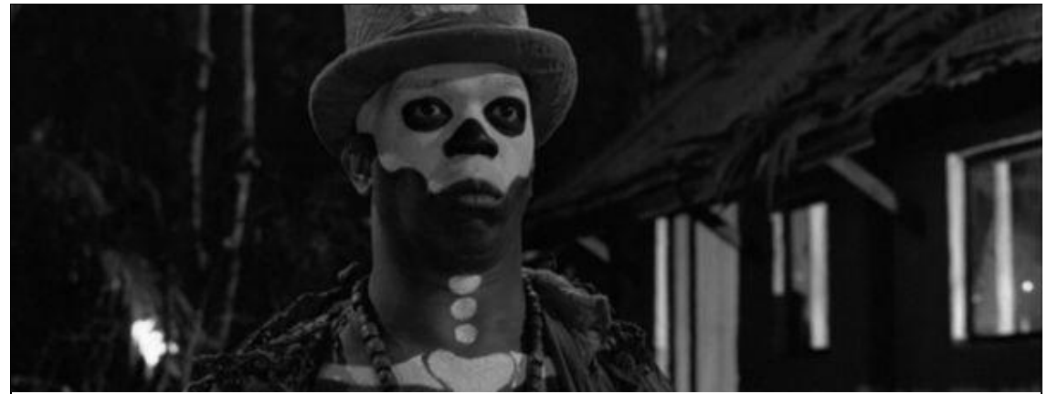
Figure 1: Geoffrey Holder as Baron Samedi in James Bond's Live and Let Die (1973).

This visual essay collects and examines select images of persons and groups who have imitated and symbolically simulated the folkloric appearance of Baron Samedi in contemporary political and popular culture. Our purpose with this essay is twofold. First, by offering a chronological presentation of "Samedi-esque" imagery, we present a record of appearance that preserves said imagery for comparison, analysis, and critique. In particular, we are interested in identifying mass media images of Samedi that have helped shape popular understandings and misunderstandings of the intersection between ethnicity and the Vodou religion. Second, we explore the various ways these images have been used to invoke fear, promote cultural stereotypes, and generate hope in the performance of "playing Samedi."