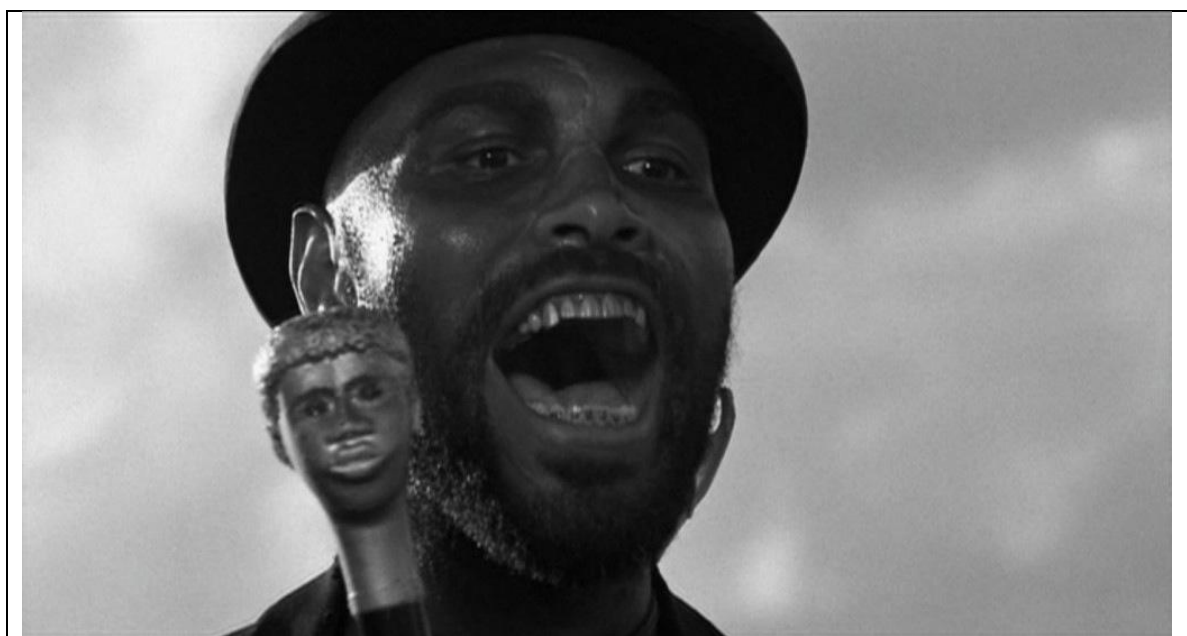
Figure 6: Don Pedro Colley as Baron Samedi in Sugar Hill (1974).

However, rather than accurately depicting the political reawakening that was going on in inner-city ghettos or showing the ongoing problems with racial discrimination that were one source of this new black activism, film makers chose instead to depict black characters as apolitical criminals or vigilantes One such example is the 1974 film, Sugar Hill.