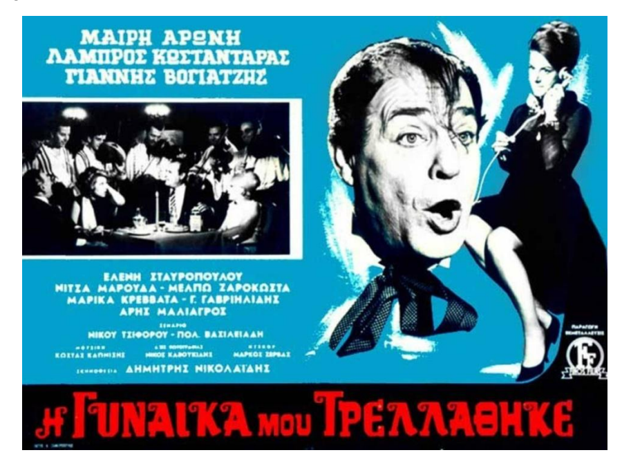
Figure 4. Poster for the particularly popular comedy film My Wife Went Mad , made through lithographic process, 1966.

Watching a graphic design of Printing Arts of N. Zafeiropoulos for the film My Wife Went Mad by Dimitris Nikolaidis, (1966) we understand that it is a balanced synthesis as it achieves to render the comic element of the film perfectly combining a film star out of his mind (Lambros Konstantaras) and the leading actress (Mary Aroni) in a typical scene depicting a celebration in a club. Simple colors, red on black for the title of the film, and a blue background on which are displayed black and white photographs. Generally this poster is a collage of pictures of typical scenes and is divided into two parts. One relies on the contributors of the film and the other, more emphatically, the comic element. Noteworthy is the lettering of the title because thanks to the calligraphic skills of the artist, it manages to exacerbate its funniness.