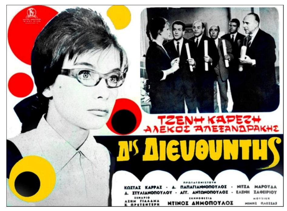
Figure 2. A 'newer' technology poster based on the techniques of lithography and collage for the film ' Miss Manager', 1964

Many of the posters - particularly the giant advertising ones – were painted by skilled artists with plenty of passion 'illuminating' with a commanding aura and great aesthetics the advertised movie itself. Certainly there were plenty of cases in which the owners themselves made impromptu handwritten movie posters which were smaller and of a less aesthetic importance but which had the same functional / propaganda value. But others, especially during the 1960's and 1970's were mainly left to the disorderly development of lithography and graphic arts and were printed massively and easily, replacing traditional painted giant advertising posters.