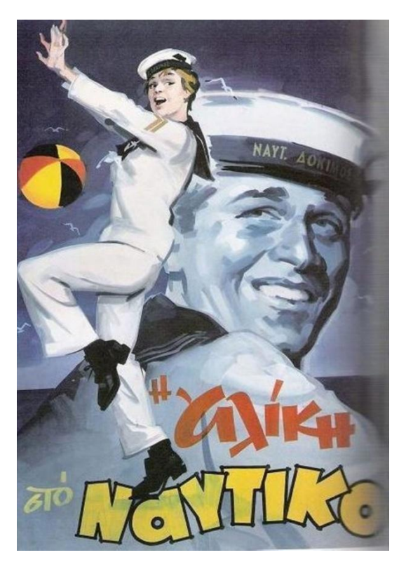
Figure 1. A giant hand painted advertising poster for the popular film 'Alice in the navy', 1961.

Many of the posters - particularly the giant advertising ones – were painted by skilled artists with plenty of passion 'illuminating' with a commanding aura and great aesthetics the advertised movie itself. Certainly there were plenty of cases in which the owners themselves made impromptu handwritten movie posters which were smaller and of a less aesthetic importance but which had the same functional / propaganda value. But others, especially during the 1960's and 1970's were mainly left to the disorderly development of lithography and graphic arts and were printed massively and easily, replacing traditional painted giant advertising posters.