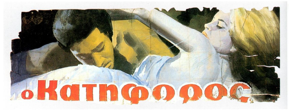
Figure 5. Giant hand painted advertising poster depicting a characteristic scene from the movie The Fall , 1962.

Based on all the above we can conclude that the most important factor in conveying the first and most effective message was the painting performance of scenes or of individuals of each piece the selection of which was the responsibility of the individual artist or graphic designer. However it was the combination of textual performance of information by the power of the image, which brought the desired result.