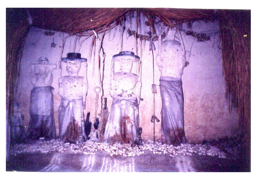
Fig. 3: Ovughere Shrine Assemblage. Wood, Native Chalk and White Cloth, Ovu Inland, Agbon Clan, 21st Century.

Each of these divinities possess their unique compositional traits as well as their functions in the entire layout of the Urhobo Culture. In most cases, the figures are divided into three segments. The head torso and lower limbs. The head consists of a hat, facial features, a neck and expressive dentition. The neck which is adjoined to the torso is thick while the torso has two upper limbs attached to its sides. The torso is also long and it consists of a bulky chest with a medicinal object, a naval, stomach and upper limbs. The upper limbs are often shown carrying full military paraphernalia<sup>8</sup>. The nude depiction of both male and female figures are evident. White cloths are eventually used to cover the pudendic area of the female and male genitals. Feets are commonly shown. The Urhobo figural pose which displays the half sitting and half standing characteristics are in most times stylized and geometric in shape.