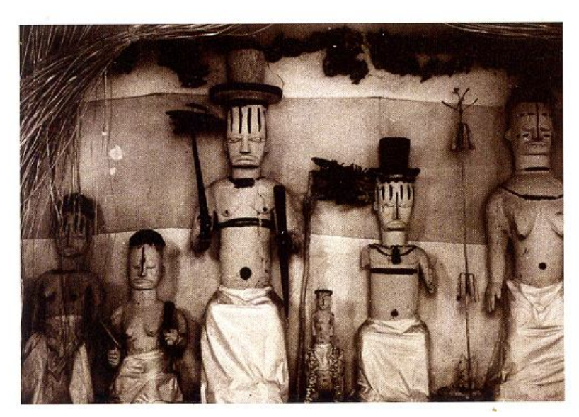
Fig. 4: The Ovughere Shrine Assemblage Wood, Pigment and Cloth, Ovu Inland, Agbon Clan 1875. Courtesy of Perkins Foss; Where Gods and Mortals meet continuity and renewal in Urhobo Art.

Utuoyo In his oral interview posits however that sometimes these sculptural pieces are accompanied with certain herbal preparations in form of native chalk ( Orhe ), herbs ( eberevwosivwoma ) and prayers ( Erhovwo )<sup>11</sup>.