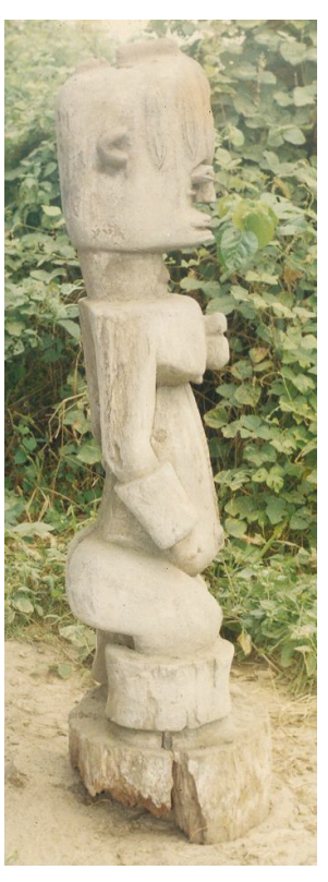
Fig. 2: The Statue of Umogun Wood, Native Chalk (Orhe) Ht. 6ft, 21st Century, Artist: Charles Ebrude; From Igun Town, Ethiope East, Delta State, Nigeria.

The Urhobo have a long tradition of woodcarving. Dates associated with these art forms extend as far back as the thirteenth century. But as regards the perishable nature of the medium, the oldest so far which is located in the Berlin museum, was purchased in the early nineteenth century. Initially, this work was formally associated with the Jukun ethnic group<sup>6</sup>. These works attest to the originality of the people resulting from its style and form. More often than not, the structure of these art works tends to perform certain functional roles (fig. 2). They also seem to speak of the origins of the people as well as containing both medicinal and psychotherapeutic attributes. These figures are not idolatry as perceived by quite a number of persons. They are our histories and mysteries which are engraved and shaped into certain human forms.