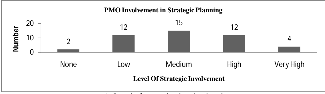
Figure 2: Level of strategic planning involvement

Respondents were asked about the level of involvement of project management in the overall strategic planning process of the organization. The results obtained are tabulated in figure 2 below.