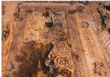
Deir al-Balah Byzantine church: mosaic of the nave

Among the other sites south of Gaza is Edrain , represented on the Madaba map by three towered village, meaning that it was larger than Thabatha (one tower). It possessed a central building, possibly a church, covered with a gabled roof. Edrain is today located at Khirbat al-'Adar on the north bank of Gaza valley (Avi-Yonah: 1954). The coastal line of Deir al-Balah was also one of the most urban areas of Gaza Strip during the Roman-Byzantine period. In 1999 the Gaza Department of Antiquities has uncovered a colored mosaic pavement of a three-aisle church dated to 586 according to its Greek inscriptions (Sadeq: 2000). The pavement of the church nave has been lifted, restored in the museum of Arles and displayed, along with many objects, at several archaeological exhibitions in European cities.