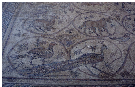
Detailed image of a mosaic pavement in the monastery of Saint Hilarion

In addition, the monastery was associated with thermal bath, consisting of frigidarium, tepidarium and caldarium halls. The wide space of these halls ensured that the baths could adequately serve the pilgrims and merchants crossing the Holy land from Egypt to Syria through the main route of via maris . The monastery was destroyed by the Emperor Julian in 375 and afterwards most likely by the Persian Sassanid invasion in 614 AD.