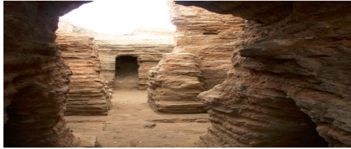
The heating installation of the monastery's thermal bath

The thermal bath was associated with water reservoirs, water installations, and open areas for cooking and baking. Several colored mosaic pavements were revealed at the site. The earliest inscription found at the monastery is dated to 539 AD.