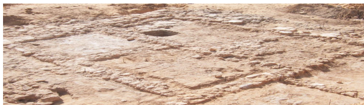
Multi-room structure at the east of Beit lahya