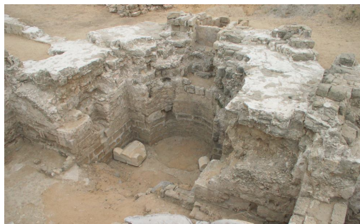
The Crypt of the monastery of Saint Hilarion

The monastery complex consists of four churches with a large narthex (cloister), the biggest crypt for pilgrimage found in historical Palestine, a funeral chamber, a baptism hall, a public cemetery, and an extensive cenobite installation. The monastery had well organized infrastructure facilities, including water cisterns, clay-ovens and drainage channels. Its floor was partially paved with limestone, marble slabs and mosaic pavements decorated with geometric patterns, plants, birds and animals. A great 5 th century mosaic is related to a specific installation for veneration of the relics of the saint Hilarion and a Greek inscription mentioning him.