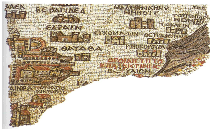
Gaza and the surrounding villages on Madaba map (Avi Yonah: 1960)

The Church does not exist anymore as it was likely destroyed either during the Sassanid invasion of Syria and Palestine in 614-618 AD under Khosroes II which resulted the destruction of almost all the Christian shrines in Palestine, or due to the strong earthquake that struck Gaza in 672 AD (Meyer: 1966, Amiram: 1996). The ruins uncovered by the author in trenches inside the grand al-'Umari mosque, the former Crusader Cathedral (Pringle: 1993), may belong to the Eudoxiana.