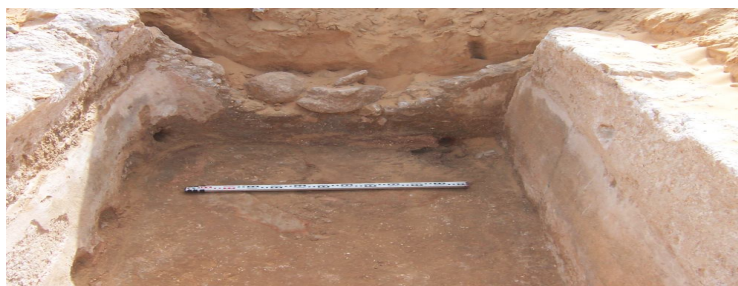
Water proof water basin east of Beit Lahya

A second prominent village north of the city of Gaza is “ Asalea ”. It is represented on the mosaic map of Madaba with a three-towered gateway, a location corresponding to the present “an-Nazla”, a municipal area within the territories of Jabalya town. Al-Nazla is most likely a corruption of the name “ Asalea ”. According to the Church historian Sozomen (400-443 AD), Asalea was the home of the holy man Alphion, who was converted to Christianity after Hilarion exorcised him from a demon. Toponym Asalea also appears in various maps of the Roman Palestine, among them that of Avi-Yonah (Avi-Yonah: 1940). Remains of a massive Byzantine Church in a basilica layout associated with a large cemetery were excavated between 1996 and 2000 on both sides of Salah ad-Din road. These remains occupy, most likely, the center of the village of Asalea . All its parts are paved with high quality colored mosaic pavements depicting series of images such as hunt scenes, human figures, animals, birds, floral and geometrical elements, mounds and rivers (Humbert 2000).