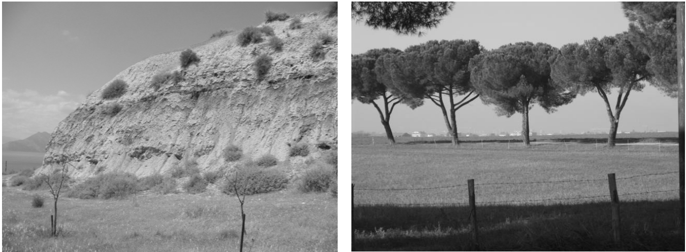
Figure 3: (left) A peri-urban landscape with poor aesthetic value and affected by soil degradation requiring restoration actions; (right) a traditional agricultural landscape in a peri-urban area with medium-high aesthetic quality.

Planning should consider criteria of multi-functionality of rural systems as a key target for the protection of natural resources and the implementation of conservative practices on fringe land. Moreover, to achieve a valuable synergy between ecosystem functioning and the aesthetic value of peri-urban landscapes, it is important to implement multi-objective interventions creating services whose benefits are not restricted to local communities while being available to a wider population inhabiting central cities (Figure 4). Appropriate actions should be definitely identified at the intersection between conservative farming practices, protection of natural habitats (namely forests and pasture land) and sustainable urban planning. Quali-quantitative approaches producing an in-depth analysis of demand and supply in land market will provide indications for fine tuned social, economic and institutional responses to land degradation, according to a predetermined set of policy scenarios.