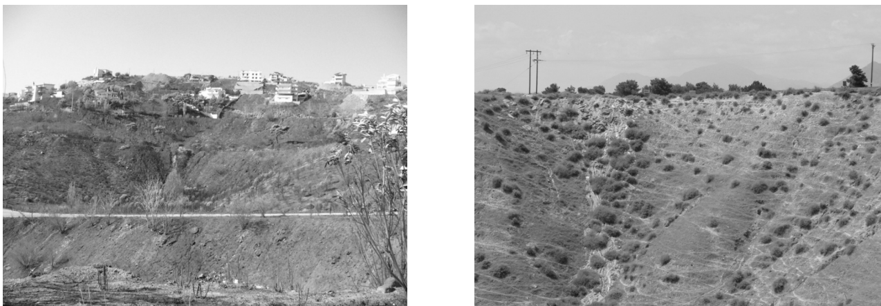
Figure 4: Landscape degradation and peri-urban agriculture (left: habitat fragmentation and consumption of fringe land after repeated burning; right: land abandonment of farming dryland under high speculative pressure from urbanization).

Analytical dimensions may include a thorough evaluation of the peri-urban land with the aim to achieve an optimal balance between measures of degradation prevention and restoration of degraded landscapes. The centrality of the 'landscape' concept in the political discourse for peri-urban agriculture suggests that a unique policy target is a sub-optimal way to reconcile environment with local community issues. A broader program for the implementation of conservative agricultural practices, the conservation of natural land and the containment of urban sprawl seems to be a reasonable - and more 'holistic' - response to land degradation in peri-urban areas.