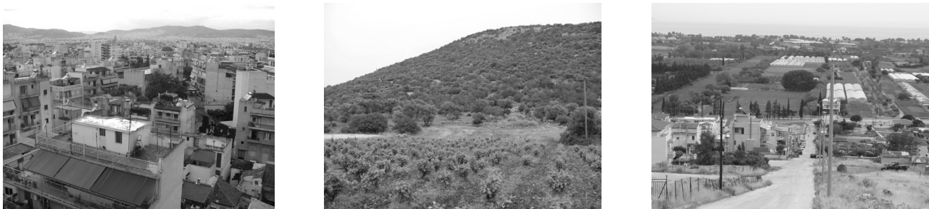
Figure 2: The urban-rural gradient in the Mediterranean region (left: compact and dense urban areas; middle: a rural area devoted to traditional agriculture, e.g. vineyards, surrounding a big city; right: a mixed landscape with low-density settlements intermixed with crop and semi-natural uses of land.

While landscape changes - more or less irreversibly - due to the impact of natural phenomena, human activities are shaping the ongoing process of land fragmentation associated with uncontrolled urban expansion. Although important biophysical changes reflect the continuous action of natural forces, the major landscape alterations are undoubtedly caused by human pressures, as already pointed out more than fifty years ago by Sereni (1961) in a seminal work on Italian rural landscapes.