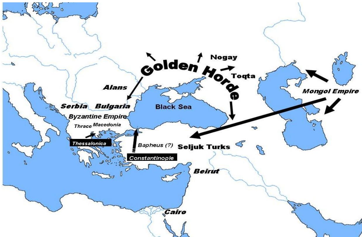
Map dealing with the time of George Pachymeres, on the verge of the 14th Century

From the 11th century, Thrace and Macedonia appear to have been usually combined, as attested by numerous strategoi and judges holding jurisdiction over both themes. The name fell out of use as an administrative term in the Palaiologan period but it is still encountered in some historians of the time as an antiquarian term.